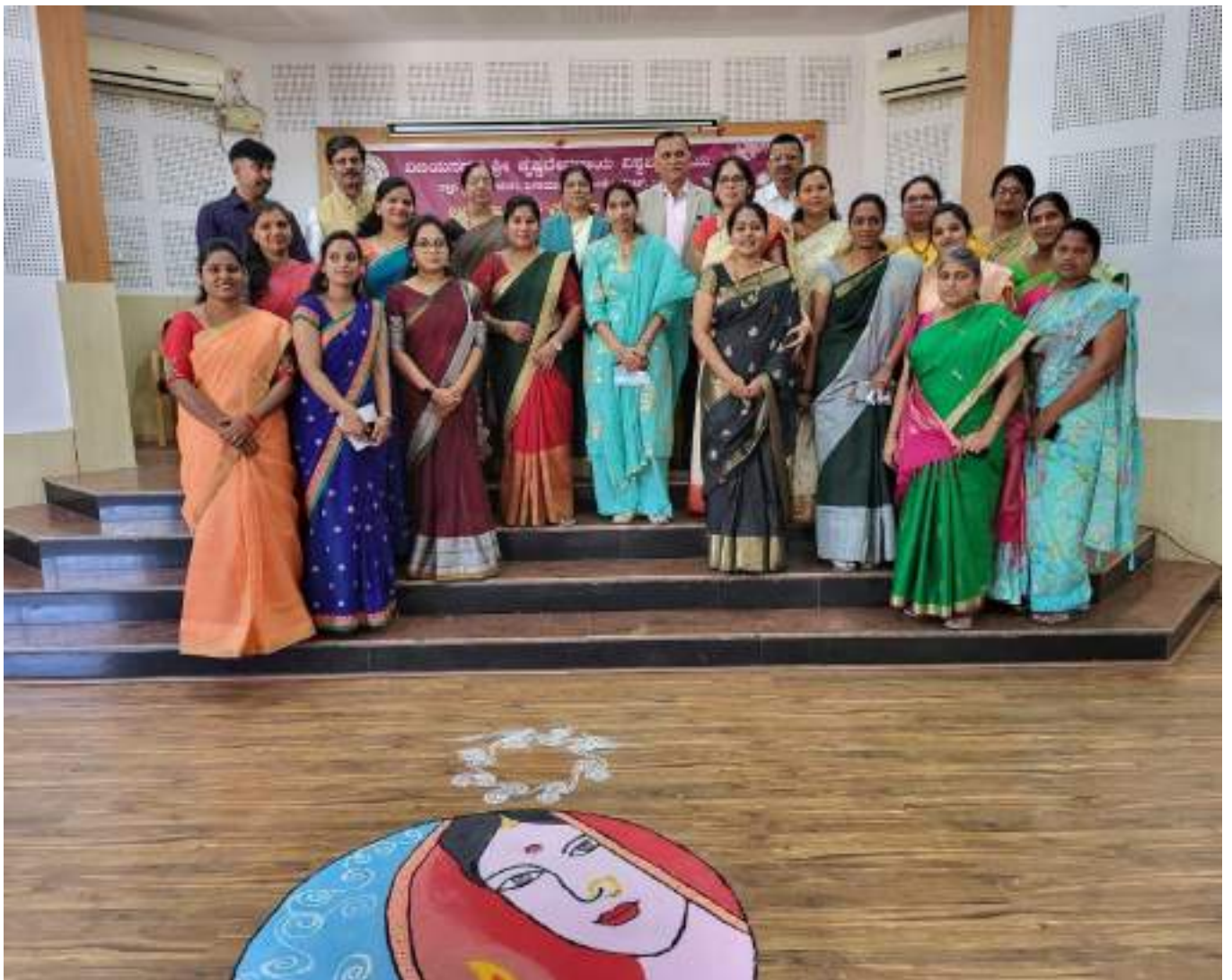
Faculty of VSKU participated in International women's day