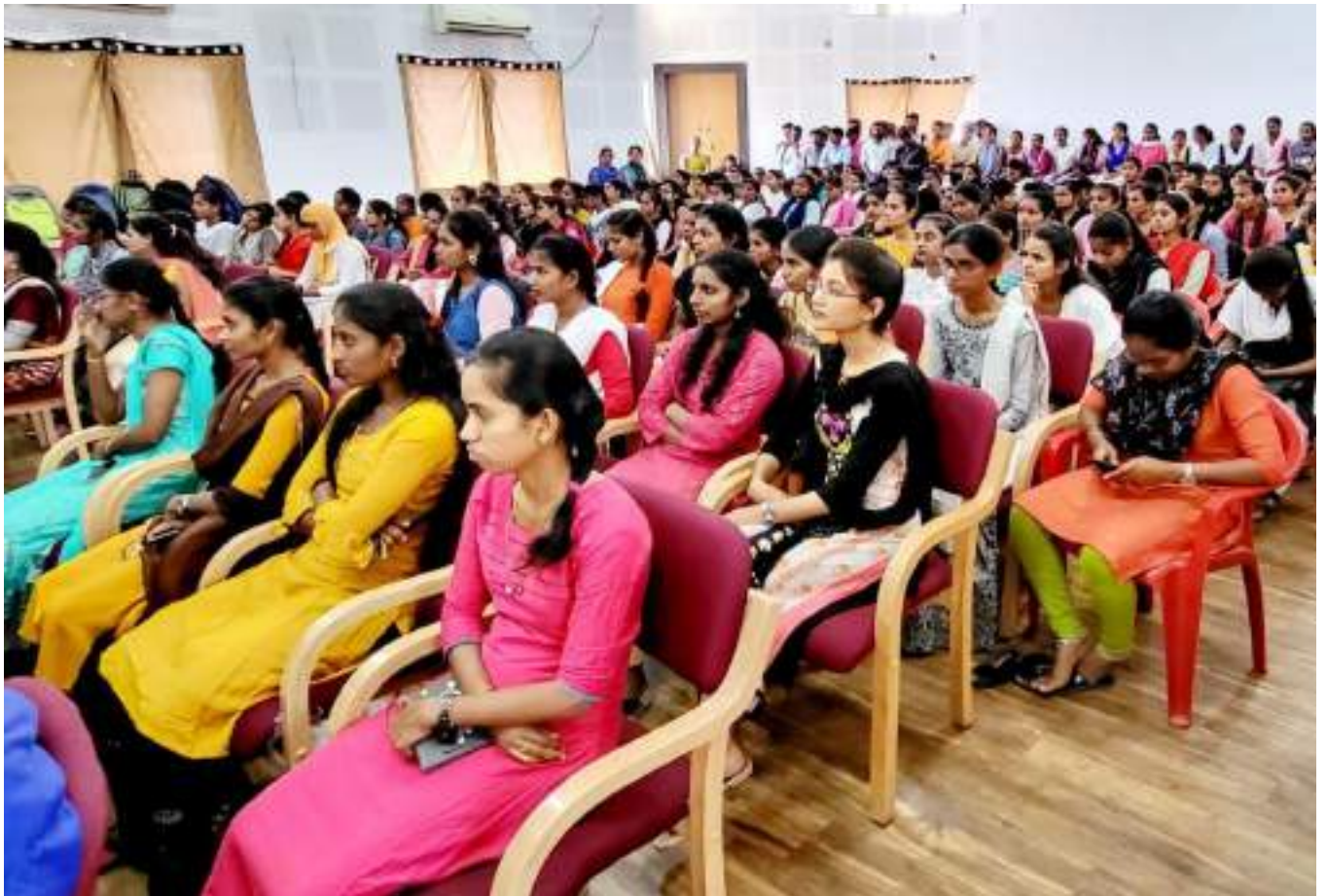
Students participating International women's day