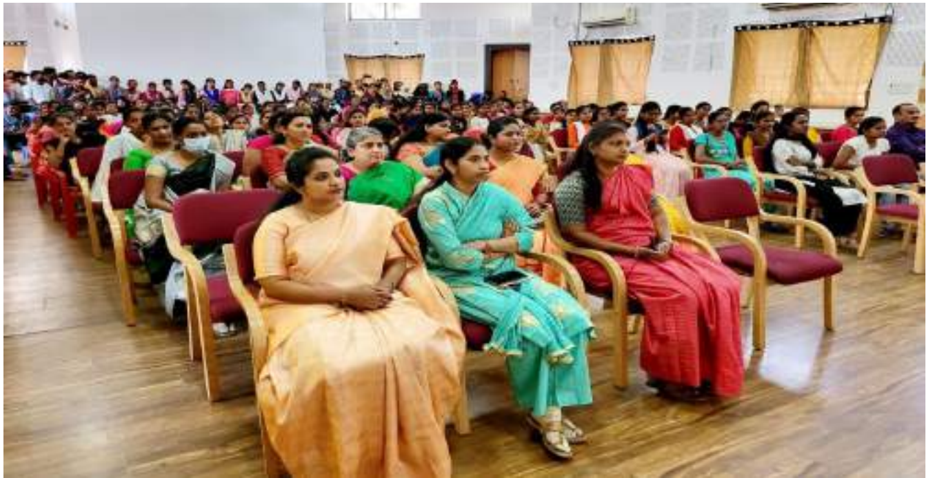
Faculty and students participating in International women's day