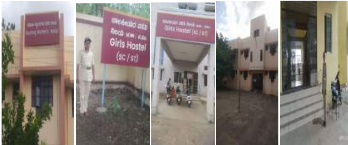
Security for All ladies' hostels