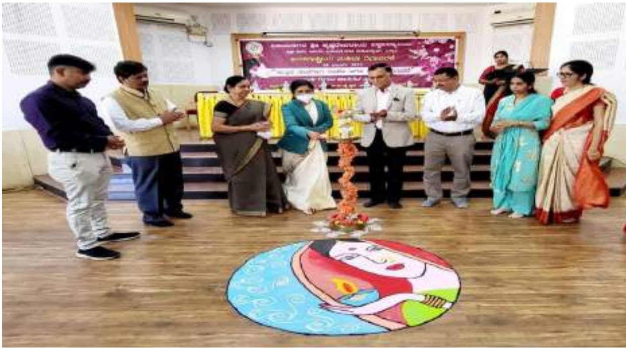
Lightening of the lamp by Guest of Honour