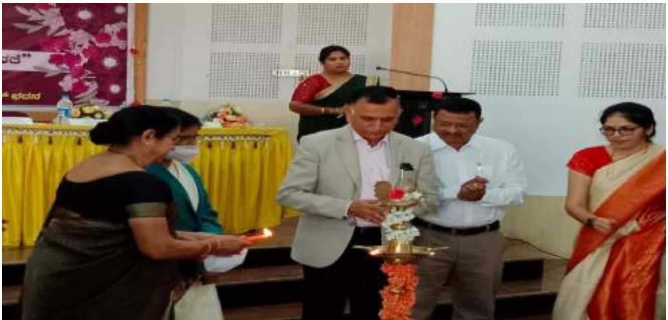
Lightening of lamp by the guests