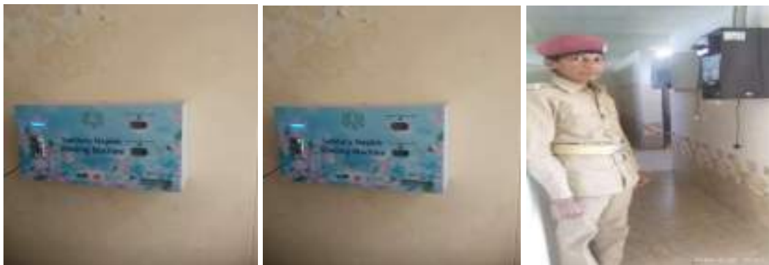
Pad incinerator machine