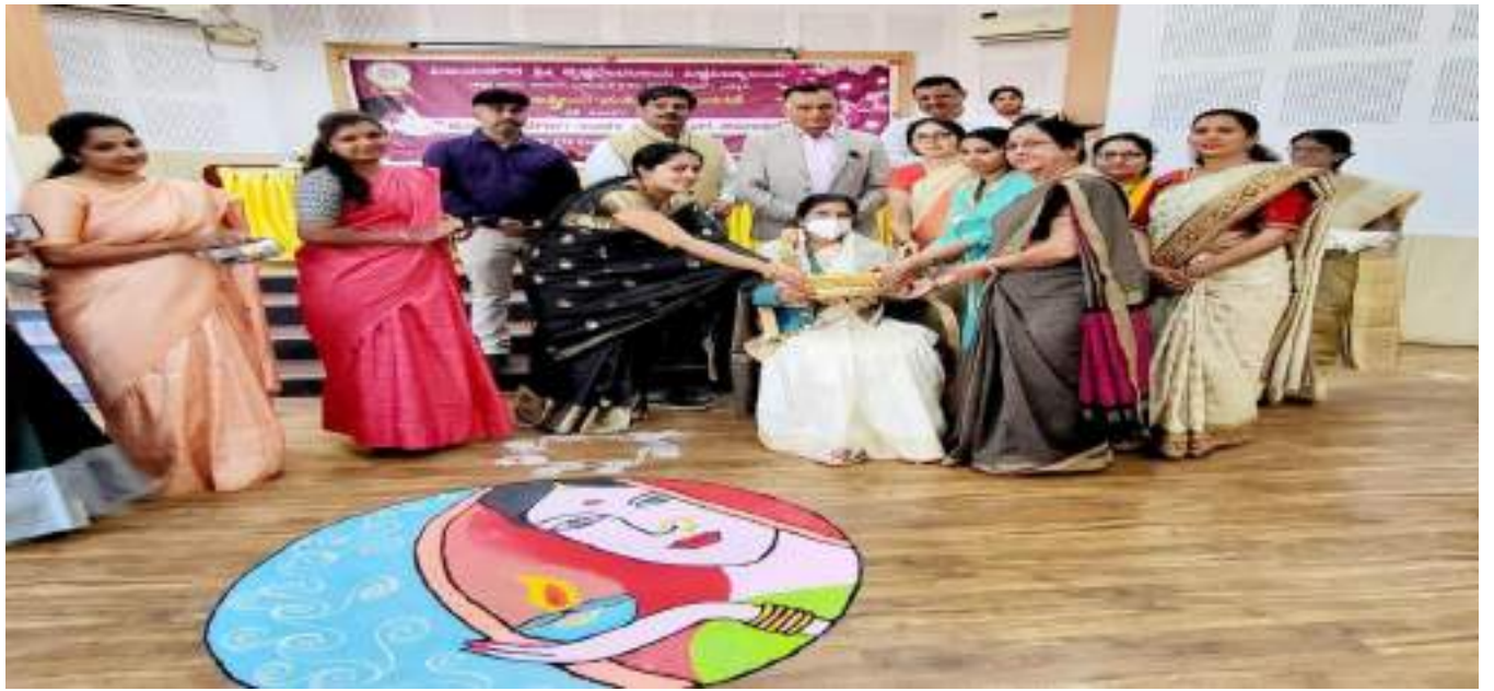
Guest of honour felicitation