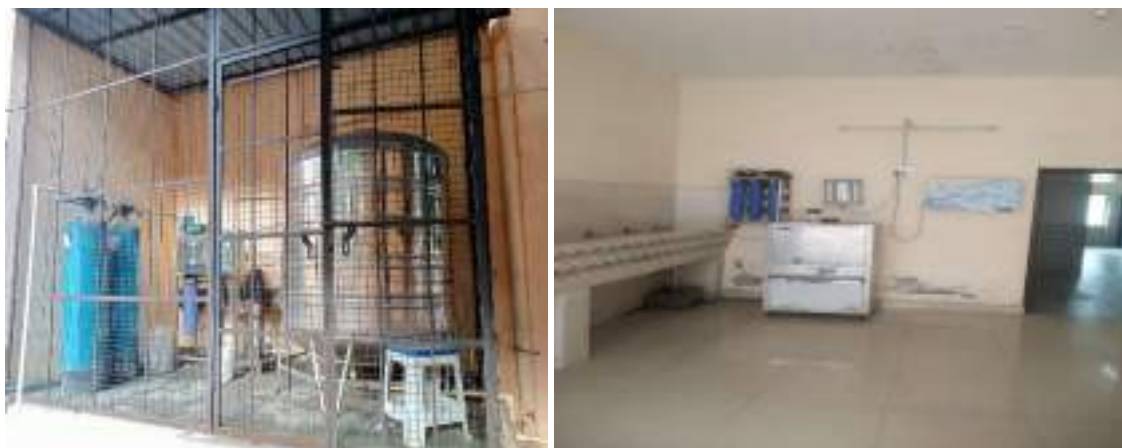
Drinking water facility in various hostel