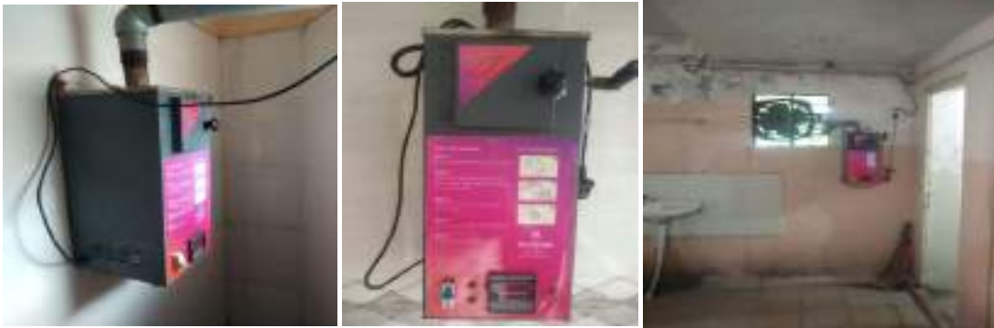
Sanitary napkin vending machine