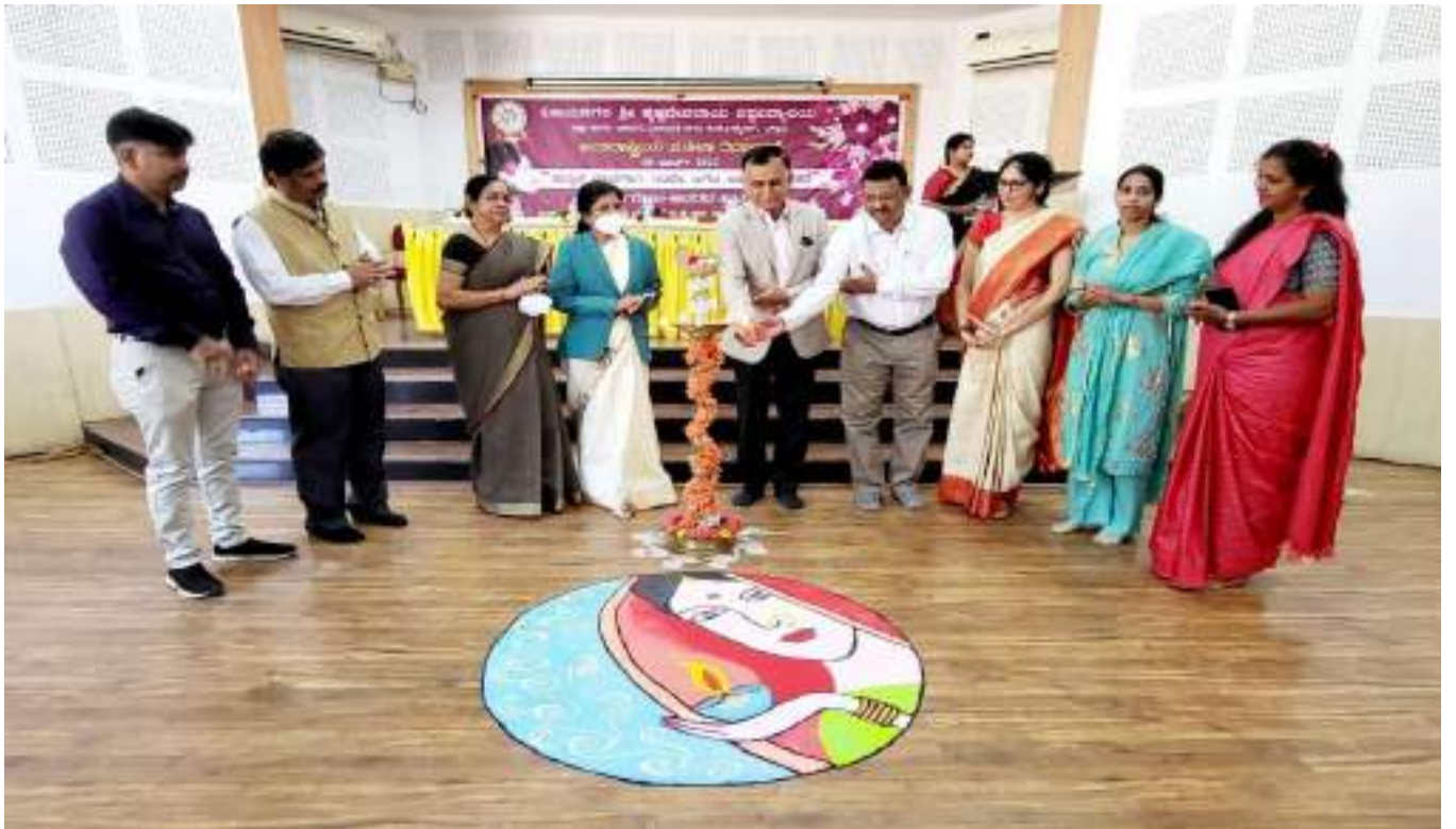
Lightening of the lamp by the Dignataries