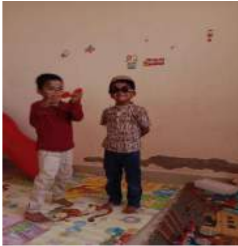
Snap for different activity of kids in crèche