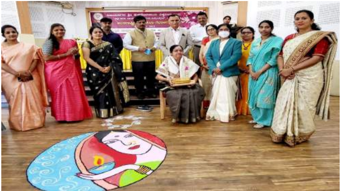
Chief guest felicitation